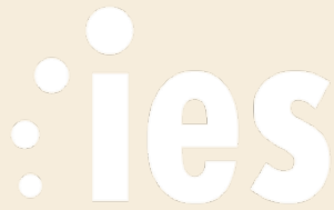
Institute of Education Sciences

Prioritize funding for federal agencies supporting education research in Fiscal Year 2018.