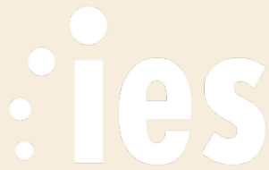
Institute of Education Sciences

Prioritize funding for federal agencies supporting education research in Fiscal Year 2018.