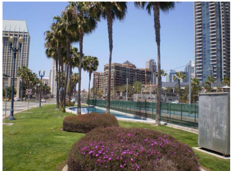
Downtown San Diego